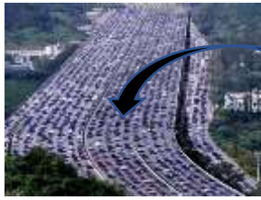
This is you!